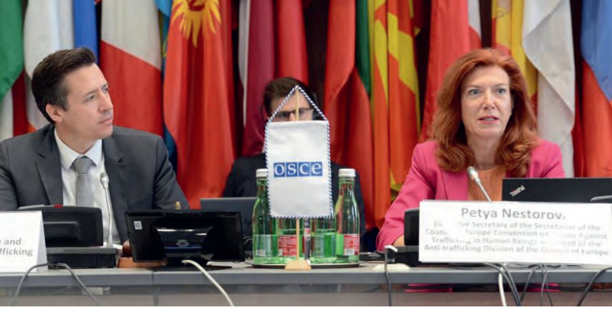
Meeting of National Anti-Trafficking Co-ordinators and Rapporteurs, Vienna, Austria, 13-14 June 2022