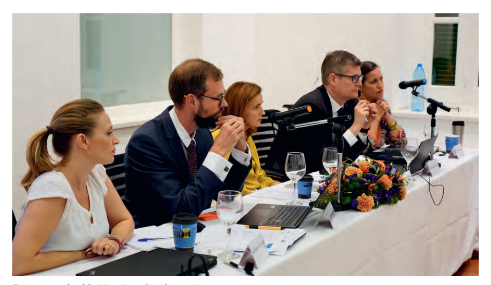
Expert round-table, Nicosia, 3 October 2022

36. As a follow up to the round-table meeting in Cyprus , an expert round-table discussion on "Access to compensation and effective remedies for victims of trafficking in human beings", was organised together with the Cypriot NGO "Step up Stop Slavery" on 3 October 2022 in Nicosia. The aim was to provide the Cypriot authorities with a comparative legal analysis and practical examples of access to compensation for victims of trafficking in human beings, particularly through state compensation schemes, as illustrated by the examples of France, the Netherlands and the United Kingdom.