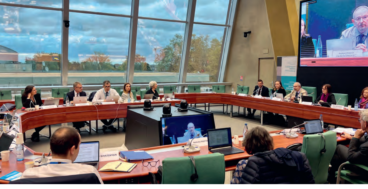
Exchange of views with judges from the European Court of Human Rights, Strasbourg, France, 17 November 2022