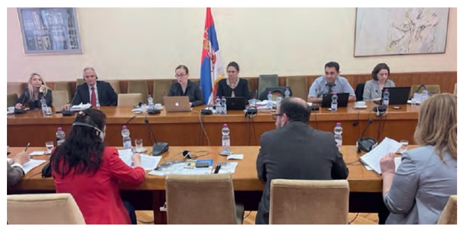
3rd evaluation visit to Serbia, 16 May 2022