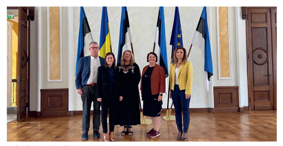
2nd evaluation visit to Estonia, 6-9 June 2022