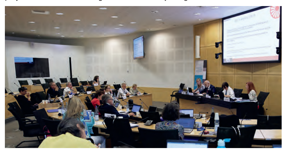
44th GRETA meeting, Strasbourg, France, 27 June – 1 July 2022