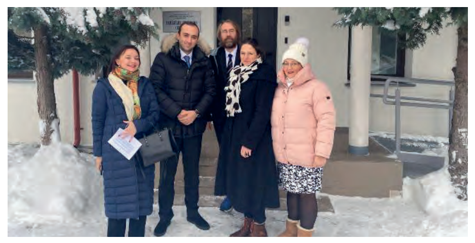
3rd evaluation visit to Lithuania, 8-12 December 2022