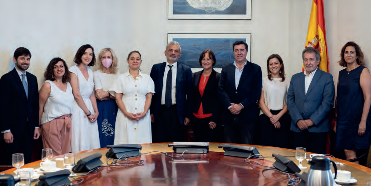
GRETA evaluation visit to Spain (3rd evaluation round), 4-8 July 2022