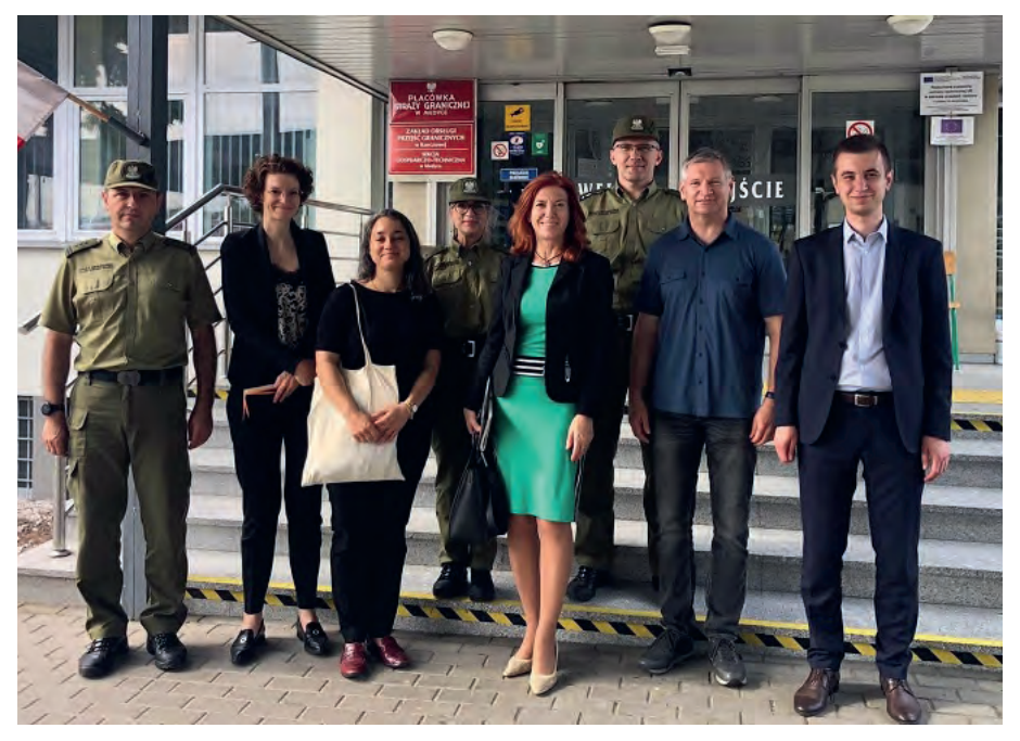
GRETA evaluation visit to Poland (3rd evaluation round), 6-10 June 2022