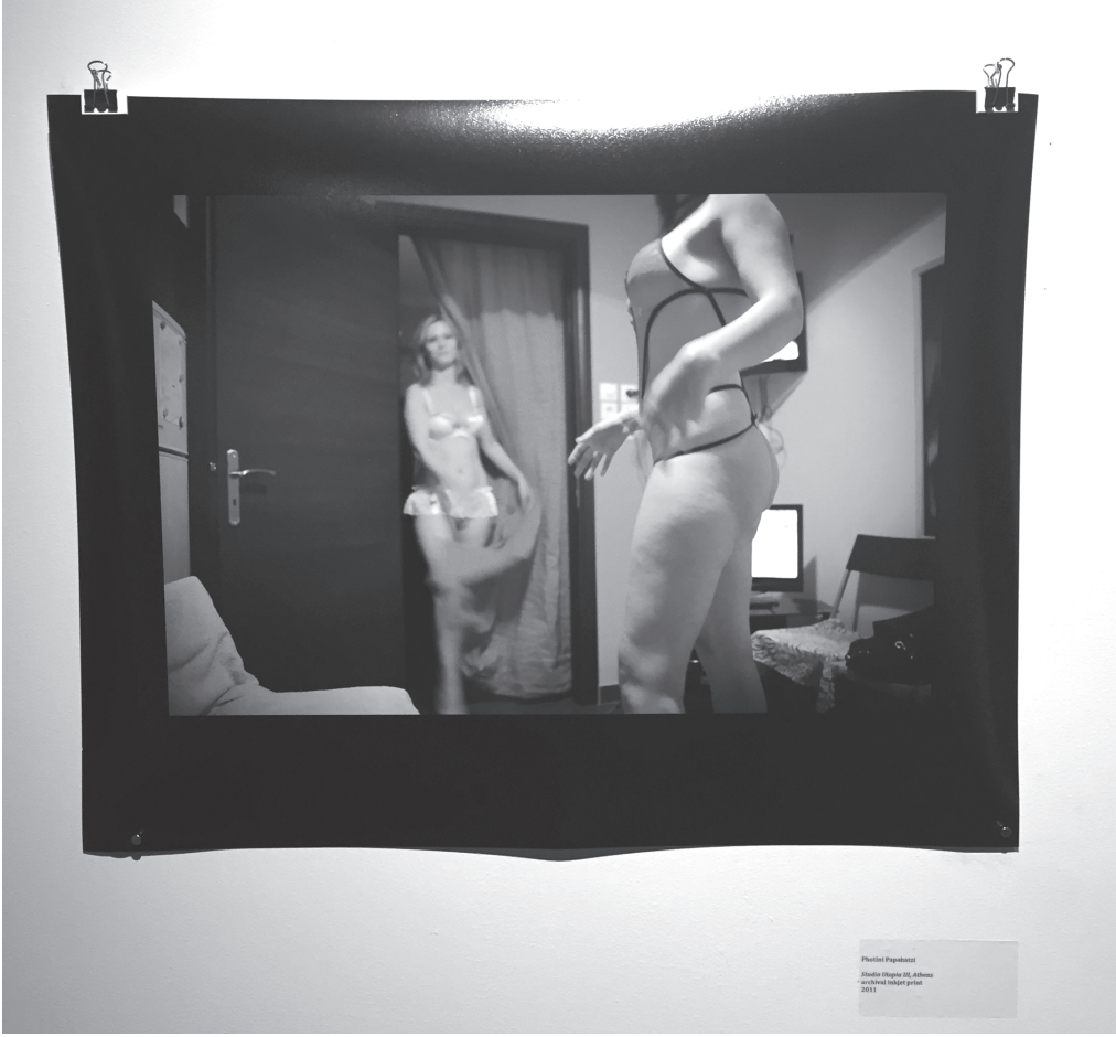
Image 3. Photograph of Photini Papahatzi's work, Anya and Andrew Shiva Gallery

In this photograph two women, presumably in a brothel, seem to greet each other. The beauty of connection between two people is shattered by the artwork's intent to force the subjects of Papahatzi's gaze into the abolitionist tradition of objectification of trafficked bodies. One female headless body appears immobilised in a mannequin-like pose, arms gracefully opened, almost like in a dance. She is almost nude, the only visible garment being a red bra tied with a string, going around her torso in a crisscross pattern. The other woman, whose visible face is slightly blurred but still recognisable, wears a frosty pink bra and frilly panties. As she enters the room from behind a red curtain, she looks open to an embrace with the woman whose head is removed from the photograph. Perhaps unintentionally, the image captures the bond between the women,