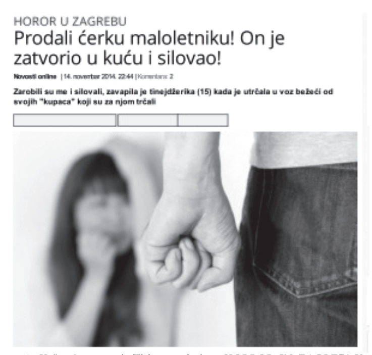
Image 1. Večernje novosti. Title translation: HORROR IN ZAGREB! Underage daughter sold! He locked her in his house and raped her!

When represented in a situation where they are attacked by a male figure, helplessness remains the prevailing motif in portrayals of the powerless victims. We see them held in the firm grip of men's muscular arms. We see clenched fists and belts in the hands of their traffickers that are ready