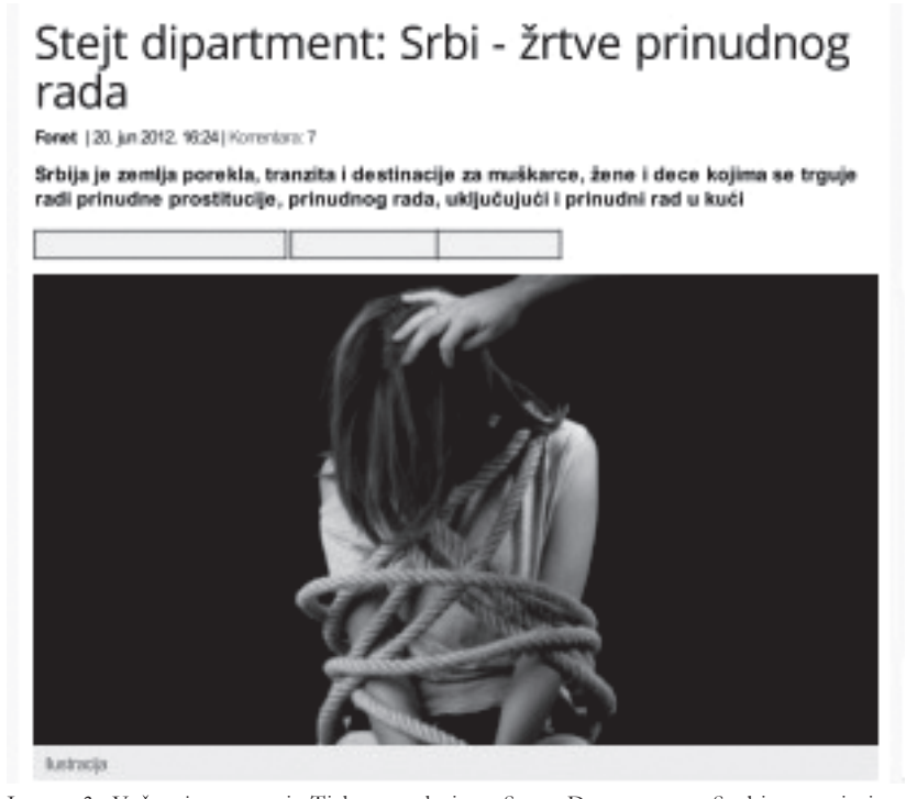
Image 3. Večernje novosti. Title translation: State Department: Serbians—victims of forced labour

in which they must sell sex. In addition, these images use the moral potential of anti-slavery endeavours, which may be interpreted as an attempt to provoke empathic reactions. However, they can also be read as directing the debate back to moral questions of right and wrong. <sup>60</sup> As a result, any response not urging a grand rescue mission is deemed immoral, as is any argument that sex work is a legitimate source of income. By sticking to the binaries of victim and perpetrator, enslaved and free, people and goods, good and evil, nuances between different cases of human trafficking are blurred. Such oversimplification in representing trafficking into the sex industry is particularly dangerous because it may promote inadequate responses to the criminal act, limit support and assistance to trafficked persons who do not fit the stereotype of a helpless white girl, and adversely affect the rights of sex workers and migrant women.