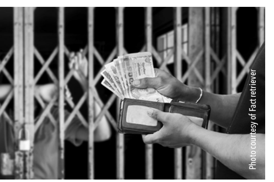
Human trafficking earns $9 billion to $31.6 billion globally.